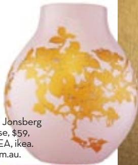
PS Jonsberg vase, $59, IKEA, ikea.com.au .