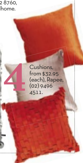
Cushions, from $32.95 (each), Rapee, (02) 9496 4511.