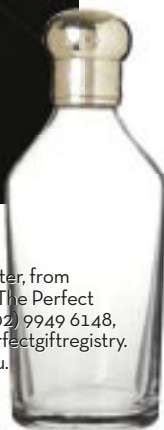
Decanter, from $115, The Perfect Gift, (02) 9949 6148, theperfectgiftregistry.com.au.