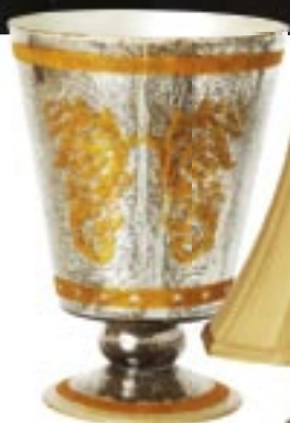
Vase, $190, Imagine This, (02) 9327 6713.