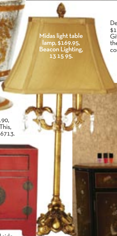
Midas light table lamp, $169.95, Beacon Lighting, 13 15 95.