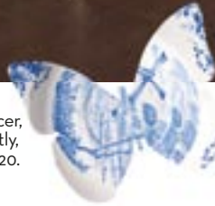
Butterfly saucer, $40, Go Lightly, (03) 9348 9520.

"We like our workspace to reflect our craft, so it's got to be beautiful. When the salon is buzzing, it's an amazing space to be in."