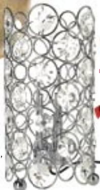
Cartier lamp, $395, Beacon Lighting, 13 15 95.