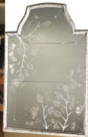
Half ballroom mirror, $1750, Caravan Interiors, (02) 9365 0500.