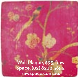
Wall Plaque, $95, Raw Space, (02) 8212 5655, rawspace.com.au .