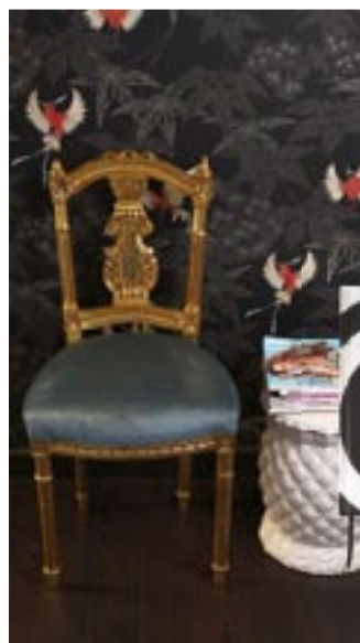
The Cutting Edge of Wallpaper by Page One (Black Dog Publishing), $59.95, from Kinokuniya, (02) 9262 7996.