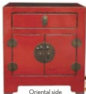
Oriental side table, $605, Coco Republic, 1300 785 039