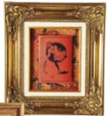
Frames, from $390, Edit, (02) 9358 5806.

"We like our workspace to reflect our craft, so it's got to be beautiful. When the salon is buzzing, it's an amazing space to be in."